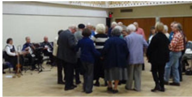
Above: Spiral dance.